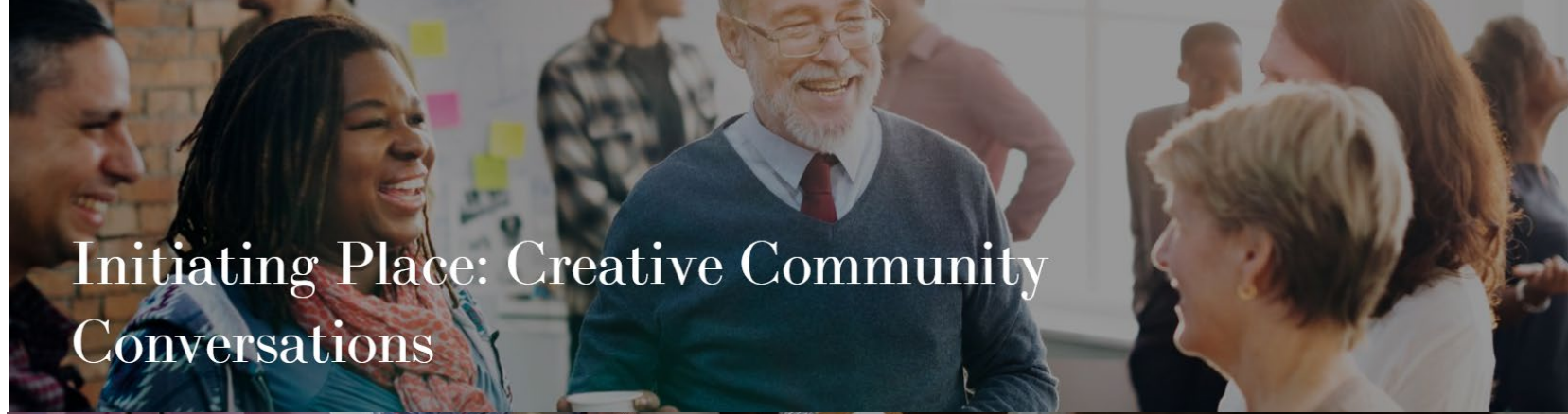
Initiating Place: Creative Community Conversations

Highlights placemaking activities, projects, and success stories from across rural America.