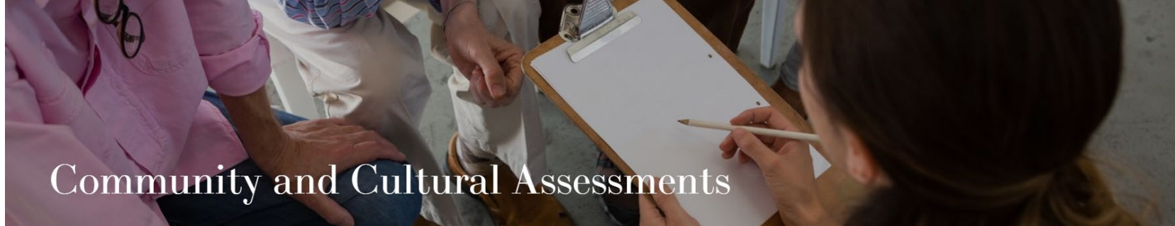
Community and Cultural Assessments