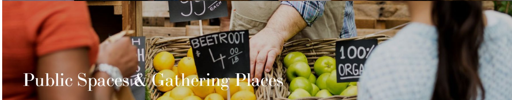
Public Spaces & Gathering Places